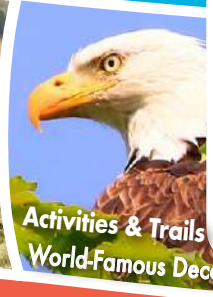
Activities & Trails World-Famous Decorah Eagles