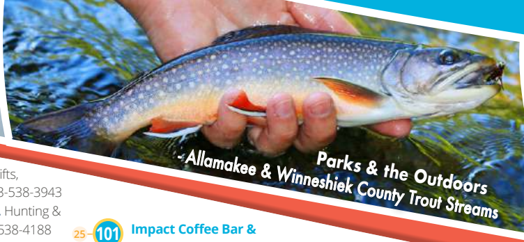
Allamakee & Winneshiek County Trout Streams