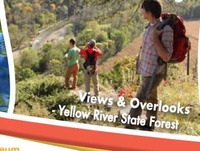
Views & Overlooks Yellow River State Forest