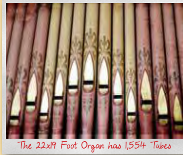
The 22x9 Foot Organ has 1,554 Tubes