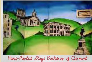
Hand-Painted Stage Backdrop of Clermont

Take a journey into the past by visiting the home of Iowa's 12 th governor, William Larrabee. Enjoy a guided tour to see and hear how the Larrabee family furnished and maintained this 1874 vintage brick and natural limestone mansion situated on 46 acres among 100,000 pines overlooking the Turkey River. Montauk is open May through August, Friday through Sunday, Noon-4 p.m. Tours are available by calling 563-423-7173.