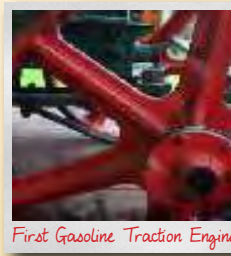
First Gasoline Traction Engine

Wander through formal flowerbeds and view a handsome bronze statue of Abraham Lincoln by taking a walk in Lincoln Park. Erected in 1902, the monument sculpted by George E. Bissell serves as a tribute to the soldiers and sailors of the Civil War during 1861-1865.