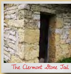
The Clermont Stone Jail