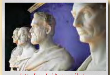
Life-Size Sculptures on Display

Observe countless collections of historical interest by visiting the Clermont Museum. Built in 1913, this former location of the State Bank was converted into a museum to showcase significant items collected through Governor Larrabee's world travels. Find everything from geological collections and prehistoric fossils to ancient artifacts and weapons of war. Museum tours are available by calling 563-423-5561.