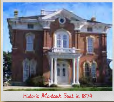
Historic Montauk Built in 1874