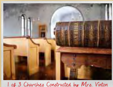
1 of 3 Churches Constructed by Mrs. Vinton