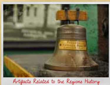
Artifacts Related to the Regions History

Erected in 1852, the stone jail was used for incarceration until the 1920s. This tiny jailhouse featured one holding cell equipped with two beds. Although people were detained for crimes, the jail was most frequented by town drunks looking for a free place to spend the night.