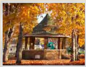
Historic Bandshell Built in 1920

Stroll through Clermont City Park and discover a historic bandshell made of Clermont brick. Take notice of the unusual planting of trees in the park. The planted maple trees form an X with the bandshell centered in the middle. The quaint city park also features sheltered picnic areas, grills and a new playground. Park hours are 6 a.m. to 11 p.m.