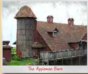
The Appleman Barn

Heritage Farm Park offers a unique mix of recreational and educational activities that truly allow you to experience what life was like in the 18 th Century. This 106-acre park features 10 miles of wooded trails, a petting zoo, campsites and a surplus of historical attractions worth exploring. Weekend tours and wagon rides are available June through August, Saturday and Sunday, 10am-5pm or by appointment. Tours are available by calling 563-419-8534.