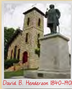
David B. Henderson 1840-1901