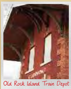
Old Rock Island Train Depot

This historic depot was originally built by the Burlington Cedar Rapids and Minnesota Railway in 1872 and later suited the Rock Island division in 1903. For over 100 years, the railroad depot was considered the area's transportation hub for passenger and freight services. Take note of the messages in the red brick carved by railway passengers and how the building sits square with the world. Tours are available by calling 563-423-7173.