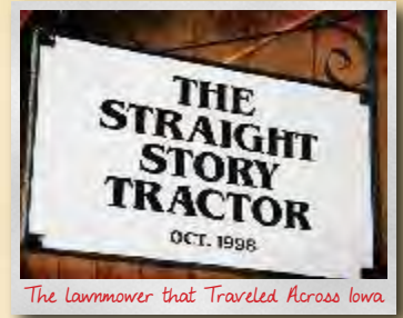
The Lawnmower that Traveled Across Iowa