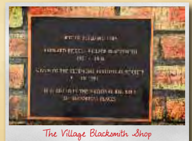
The Village Blacksmith Shop