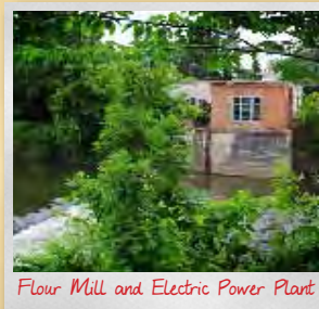
Flour Mill and Electric Power Plant